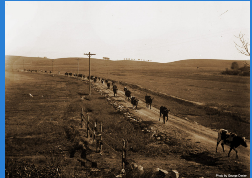
Cows on Jeffreys Neck Rd.

We love seeing the photos you take of Great Neck, and need as many as we can find for our newsletters.